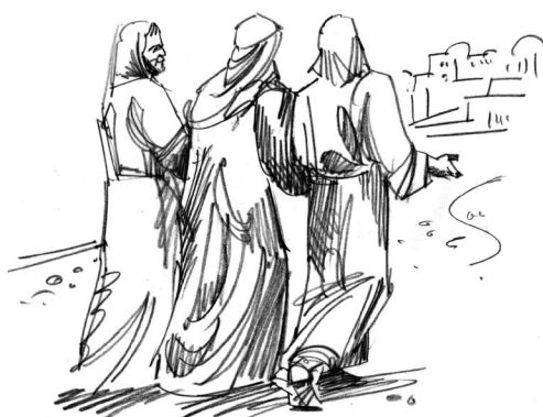
"Road to Emmaus" Illustration with permission from The NEWSLETTER Newsletter

As we are on the road together with Christ Jesus